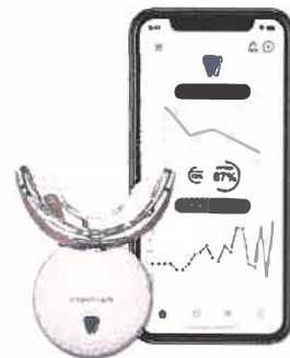
vBite™ with IntelliTrack™

*Products shown above are computer-generated demo versions. The product is still currently under development and is not yet available on the market.